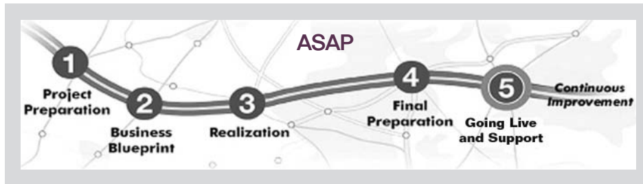
Figure: ASAP Methodology Support from Project Preparation Through Going Live

Aligned with formal project management standards and procedures (including the Project Management Institute [PMI] A Guide to the Project Management Body of Knowledge ), ASAP provides project management expertise that is particular to SAP software and critical to a successful implementation. By using the ASAP methodology and tools during an implementation project, a